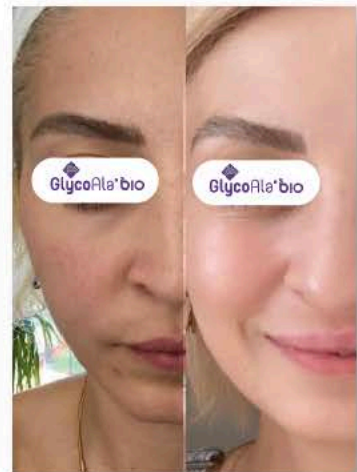
Facial Hyperpigmentation & Dull Skin