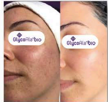
Facial Hyperpigmentation Oily & Dull Skin