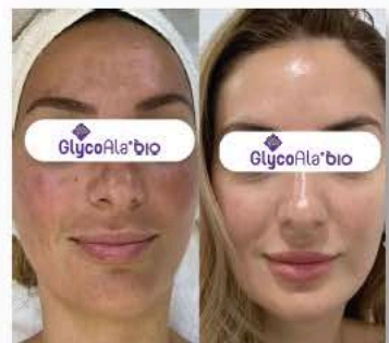
Facial Hyperpigmentation Oily & Dull Skin